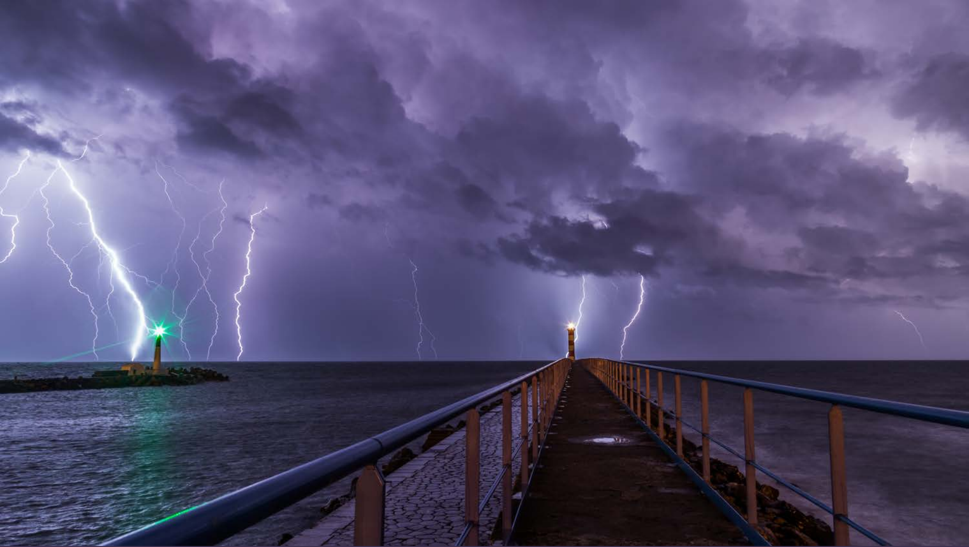
Photo by Maxime Raynal; finalist, Wikimedia Commons Picture of the Year, 2015; 1/13/18 10:29 PM https://commons.wikimedia.org/wiki/File:Port_and_lighthouse_overnight_storm_with_lightning_in_Port-la-3_Nouvelle.jpg