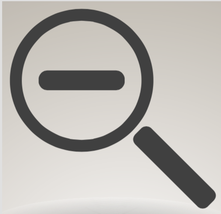
A Bigger Frame